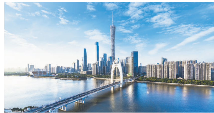
Canton Tower, at the south bank of the Pearl River, is the landmark of Guangzhou city.