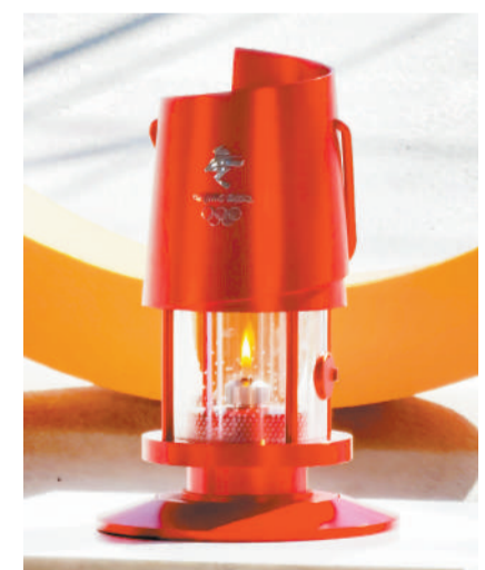
The kindling lamp of the Beijing 2022 Winter Olympics adopts the appearance of the Gilt Bronze Human-Shaped Lamp.

In order to solve these problems, team members utilized the double-layer structure and opened up space from top to bottom entirely so that when there is air pressure on the top of the lamp, the carbon dioxide exhaust in the chamber can be smoothly discharged from the sidewall space.