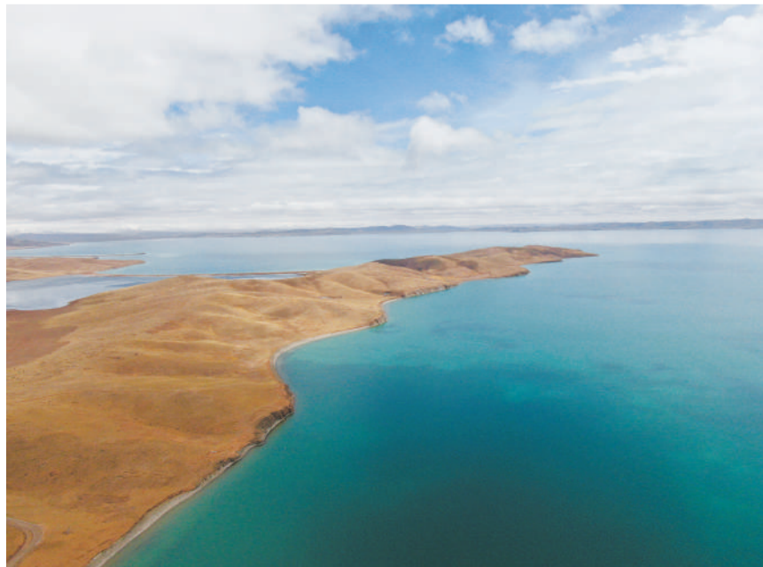
Aerial photo taken on May 25, 2021 shows a view of Ngoring Lake in the Sanjiangyuan National Park in Golog Tibetan Autonomous Prefecture of northwest China's Qinghai Province. The ecological system has been steadily improving in recent years in the Sanjiangyuan National Park, making it a habitat of an increasing number of wild animals.