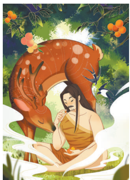
A creative picture of a legendary divine farmer: Shennong

Over the centuries, there have been many versions of the story of Shennong. However, by all accounts, because of his efforts, countless herbs are now used in traditional Chinese medicine and the importance of traditional herbs are now widely accepted.