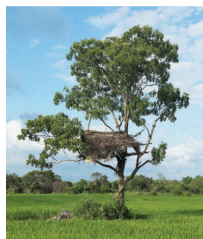
A tree house.

In the history of Chinese civilization, Youchao took this vital step to help distinguish humans from animals.