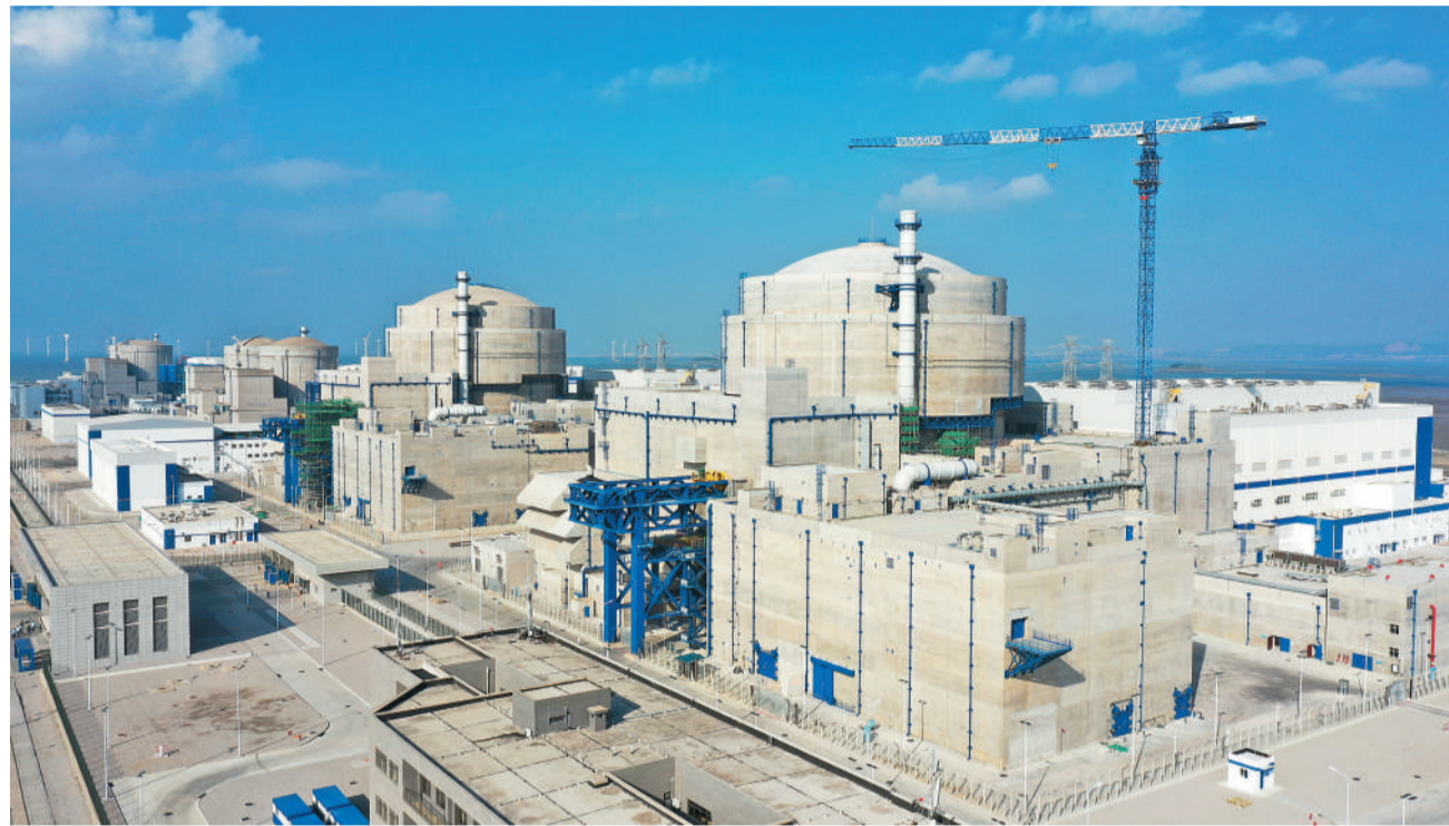
Fuel loading has started at China's second nuclear power unit using Hualong One technology, after the first one entered commercial operations earlier this year.

China will also inject impetus into economic recovery and sustainable development in the Asia-Pacific, and strive to build a global community of development with a shared future, he noted.