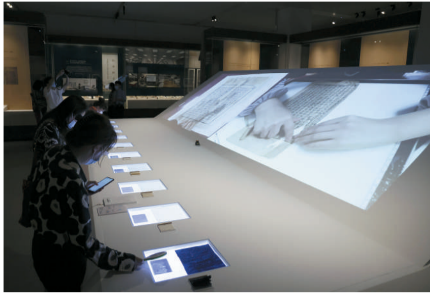
An exhibition of ancient books restoration achievements.

Sci-tech innovation will inject strong impetus into the region's high-quality development, and lay a solid foundation for a beautiful, healthy and safe Xinjiang, says the plan.