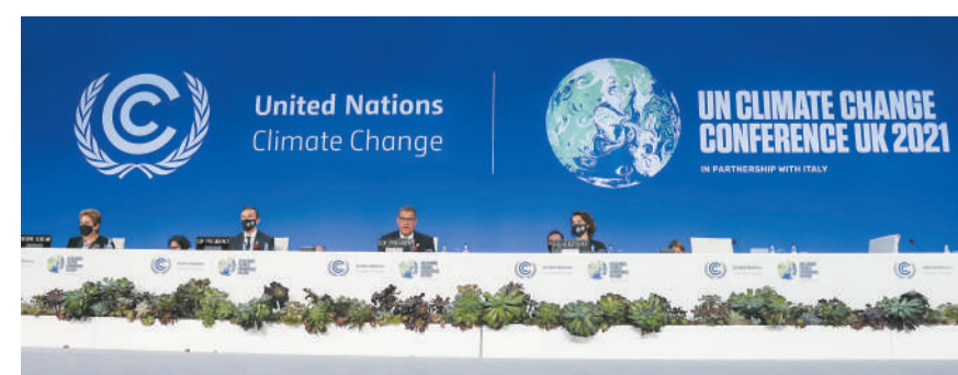
The closing plenary of COP26 to the United Nations Framework Convention on Climate Change in Glasgow, Nov. 13, 2021.

COP26 is the first climate change conference after the five-year review cycle under the Paris Agreement inked in 2015. COP27 will be held next year in Egypt with updated plans on how to slash greenhouse gas emission by 2030.