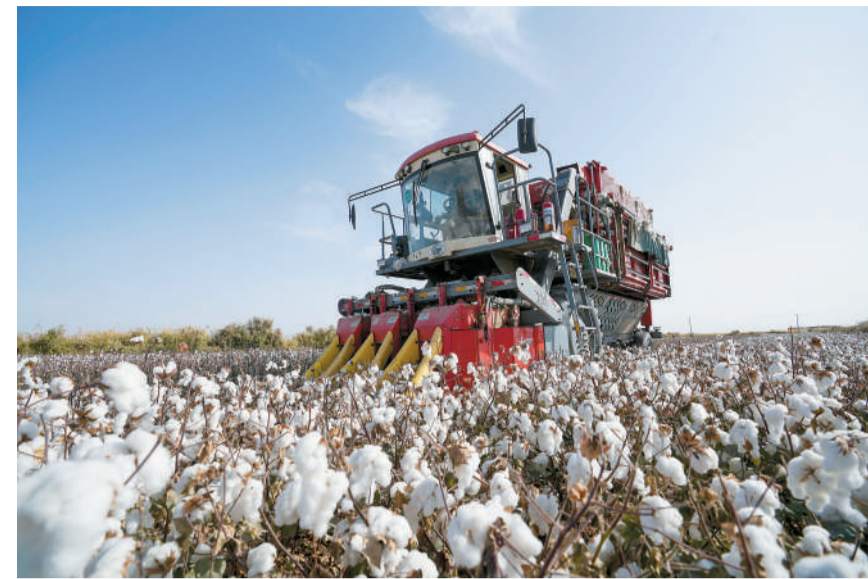
A cotton picker works in fields in Yuli County, Xinjiang.

By 2035, China will put in place a cultural relics protection and management system commensurate with the goal of developing the country into a cultural power, and the development of sci-tech innovation personnel will provide strong support for the protection, research and utilization of cultural relics.