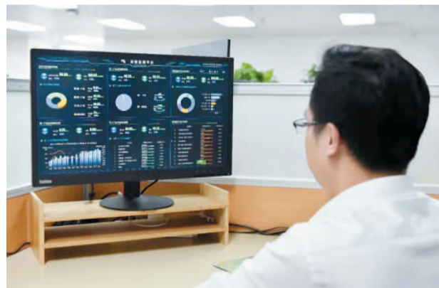
Dual carbon brain.

Wang Zhengsi, deputy director of application support department of SPSB's information Center, said that the system will provide multiple services such as energy consumption detection, index display, and problem location. Meanwhile, it may become a significant system to provide energy consumption monitoring and