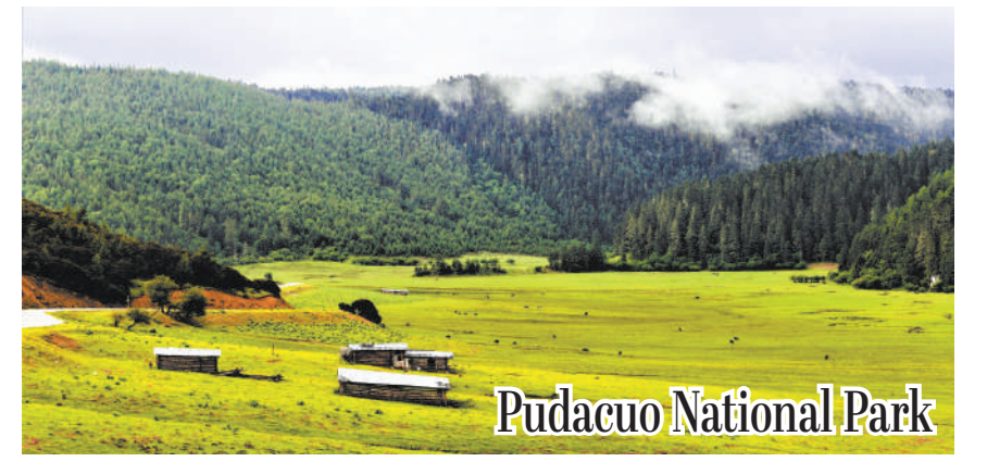
Pudacuo National Park, located in Yunnan's Diging Xizang Autonomous Prefecture, covers an area of 602.1 square kilometers.

Several facilities are expected to attract more foreigners to the capital, including Huairou Science City, an important support facility for the national science and technology innovation system, which has entered a new stage of construction and operation. In addition, Yanqi Lake International Convention Center and Huairou Film & Television Industry Park will also be built as the hub for the main diplomatic activities and the demonstration base for the integration of culture and technology respectively.