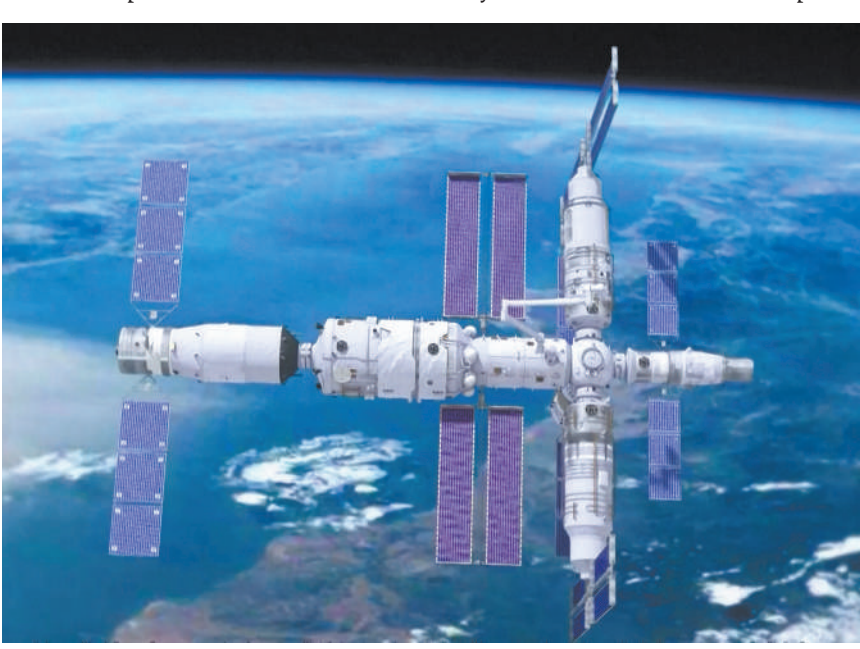
Animation shows the completed Chinese space station.

mv.' All of these achievements and plans are China's new journey into space in cooperation with other countries, and also efforts of all countries to work together to build a global community with a shared future in outer space.