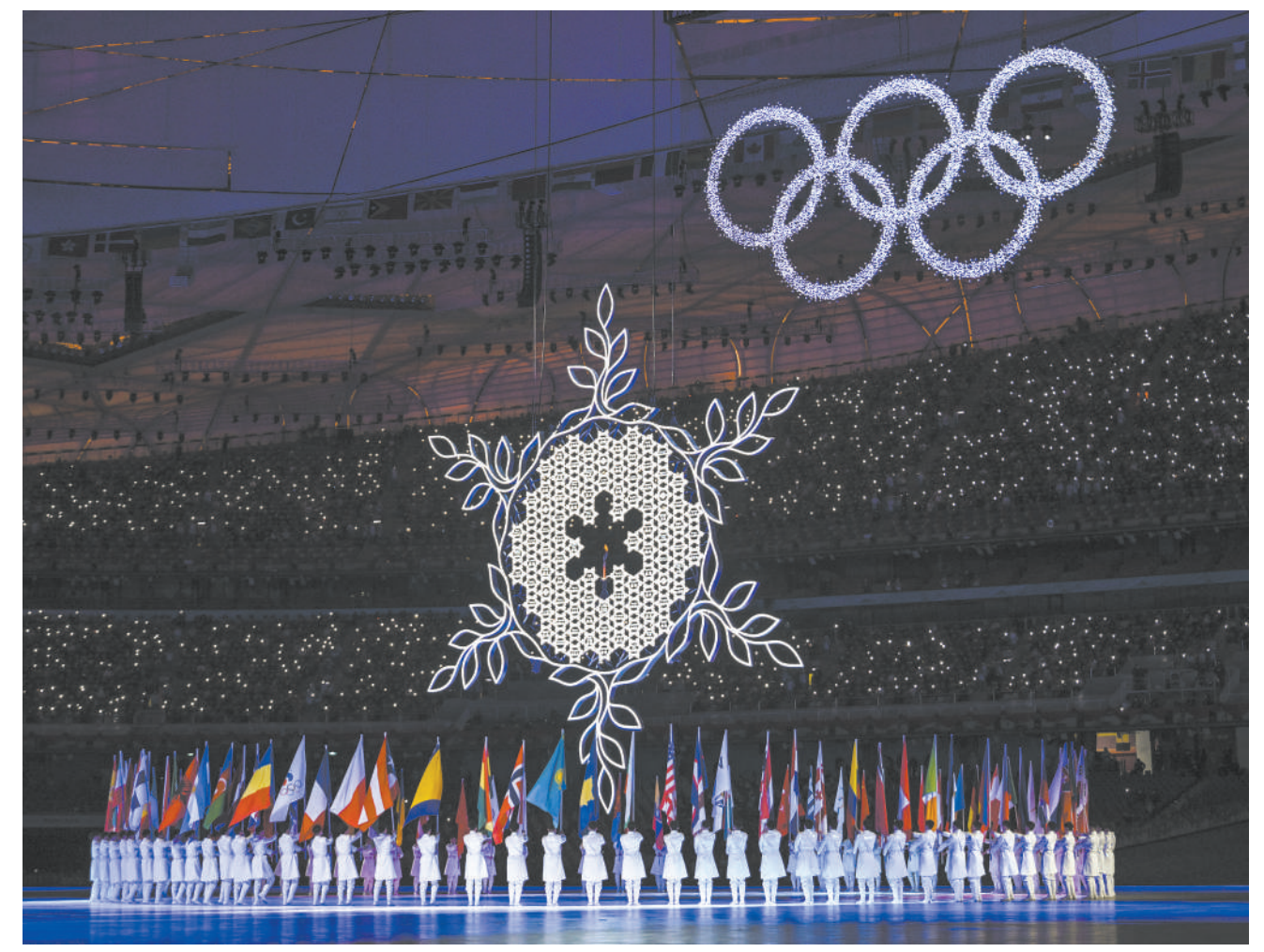
The Olympic flame is extinguished during the closing ceremony of the Olympic Winter Games Beijing 2022 at the National Stadium in Beijing.

Like the South-to-North Water Diversion Project and the west-east power transmission program, this project, which optimizes the nationwide resource allocation and improve resource utilization efficiency, will raise the country's overall computing capacity, promote green development, expand effective investment and coordinate development among regions, NDRC official Sun Wei said.