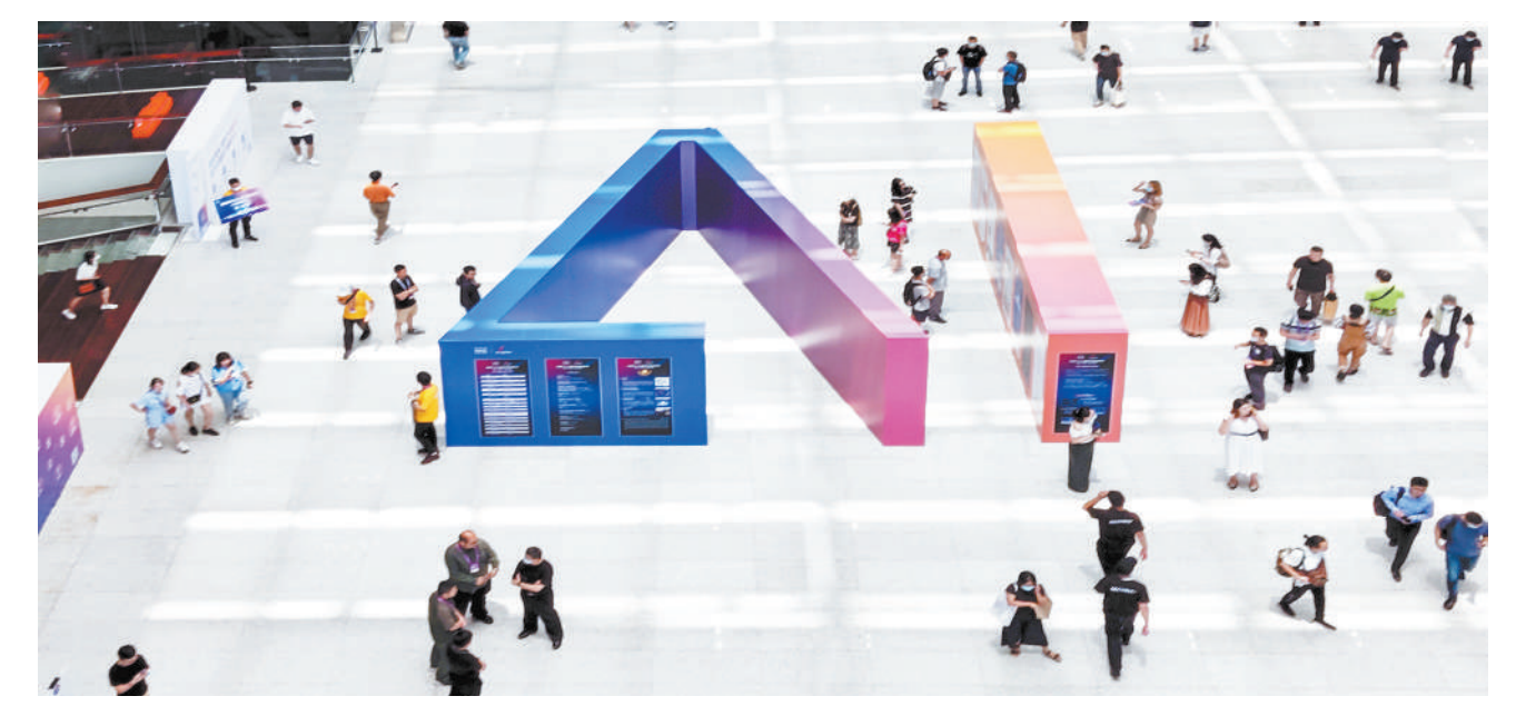
China is leading the way on ethics governance in key areas such as the life sciences, medicine and artificial intelligence. Photo shows the 2021 World Artificial Intelligence Conference held in Shanghai.

Ethics compliance should be emphasized throughout the process of scientific research and technological devel-